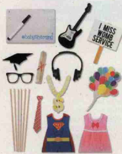
Add some cheeky humor to your baby pics with these hilarious Baby Selfie Props . $8.99, perpetualkid.com