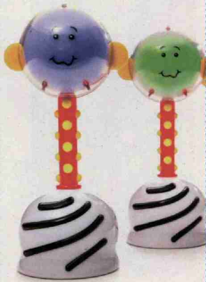
Nogginstik's Developmental Light-Up Rattle $24.99, smartnoggingtoys.com