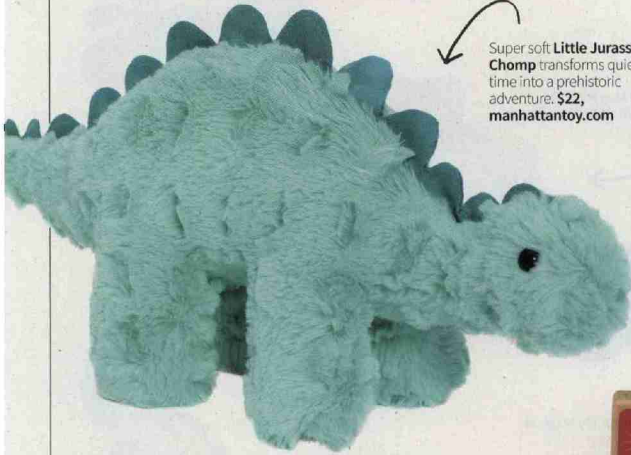
Super soft Little Jurassics Chomp transforms quiet time into a prehistoric adventure. $22, manhattantoy.com